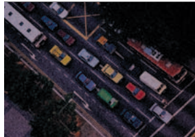
JVC Super LoLux™